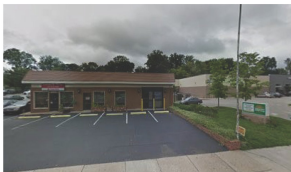
205 E Butler Ave Ambler, PA 19002